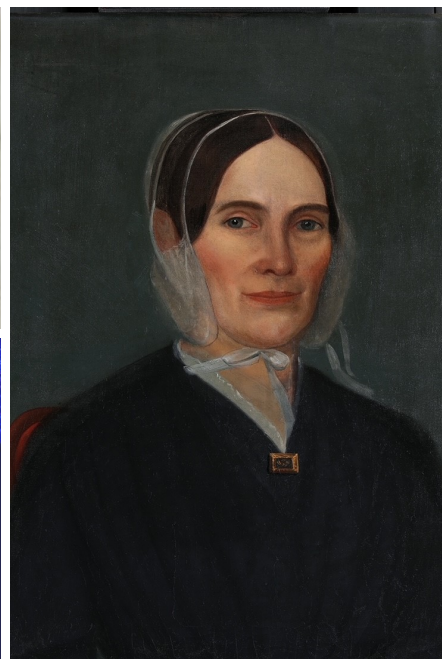
Sense of Place

Groton History Center | Gov. George S. Boutwell House | Groton, MA grotonhistory.org | info@grotonhistory.org | 978-448-0092