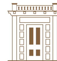
GROTON HISTORY CENTER Framing our story

Endowment support for the museum includes staffing, insurance, general maintenance, and utilities. Much of the GHC's operating budget comes from giving such as memberships and annual appeal. While this has consistently allowed us to remain steady at our current operations, it does not allow the expansion we envision. Additional gifts to this endowment would allow us to use a larger portion of investment income and provide a reliable source of income for those expenses not covered by annual gifts.