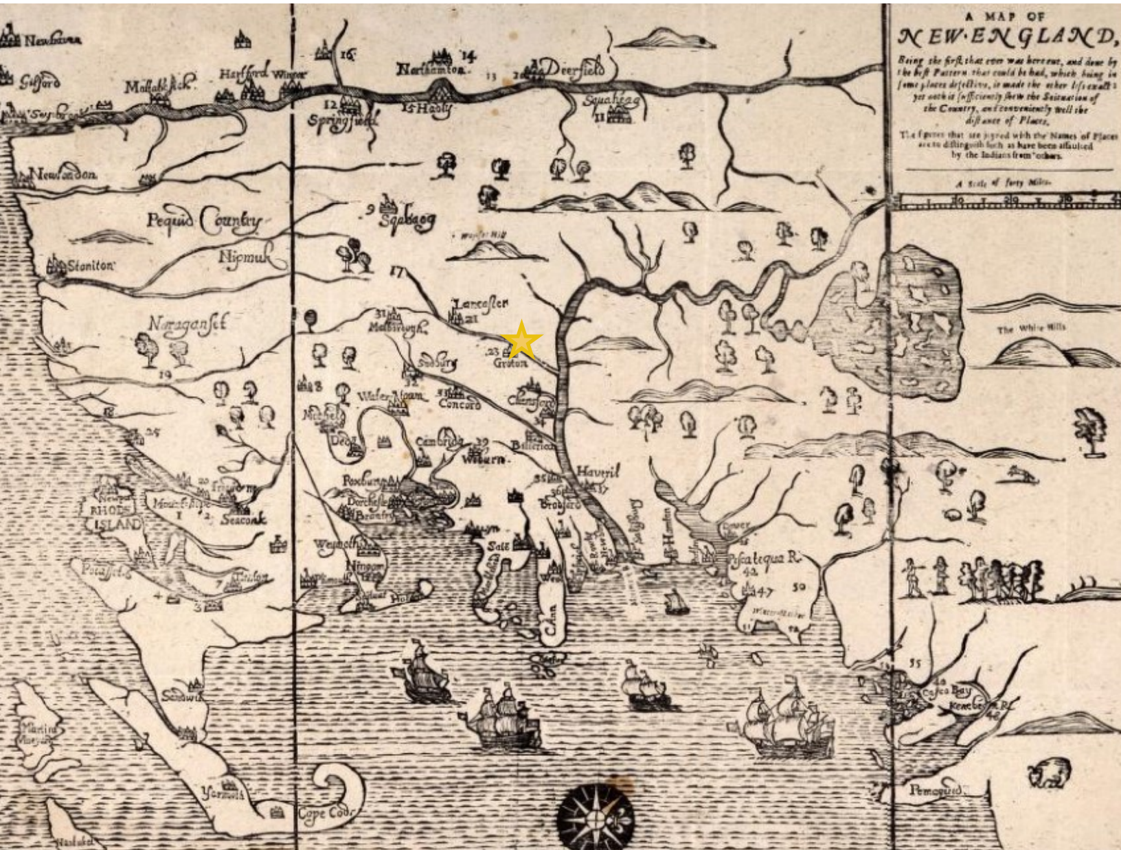
Oldest known map of New England, by John Foster, 1677